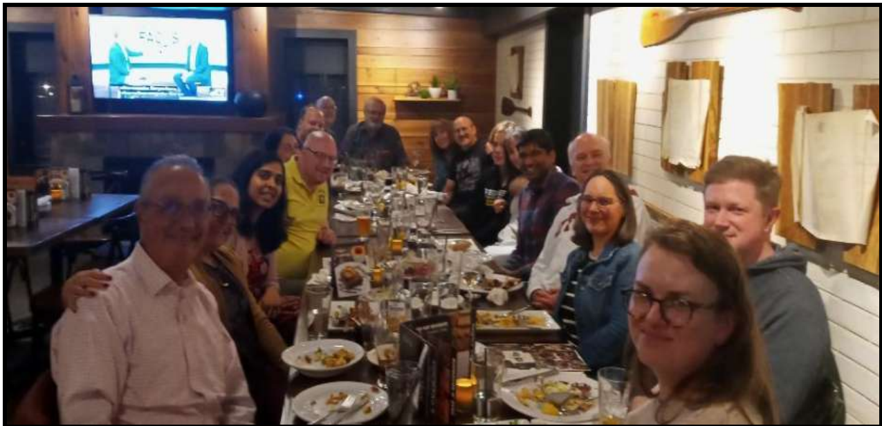
The NBCC volunteers and their family