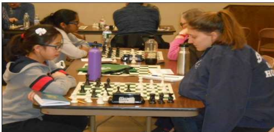
BACK TO FRONT, LEFT TO RIGHT