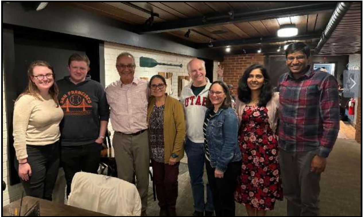
The NBCC officers and their spouses