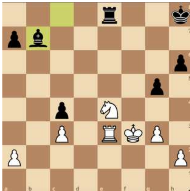
The Forever Pin Should Win!

41... Rf8+ 42. Kg4 Bxe3 43. Rxe3 Re8 44. Kf5 Bc8+ 45. Kf4 g5+ 46. Kf3 Bb7!