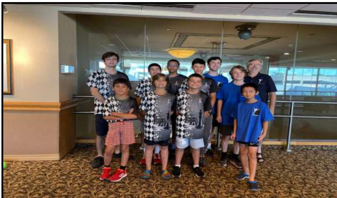
Members of the HCC present before round 4 of the 2023 Bradley Open Chess Championship

The Play More Chess Academy and the Hamden Chess Club seek to offer a wide range of opportunities for all ages to play and improve their skills at this most amazing game of chess!”