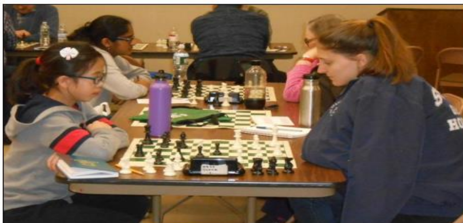
BACK TO FRONT, LEFT TO RIGHT