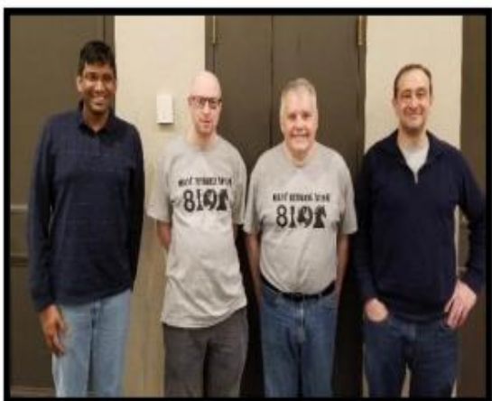
BITCOIN PONZIANI SCHEME