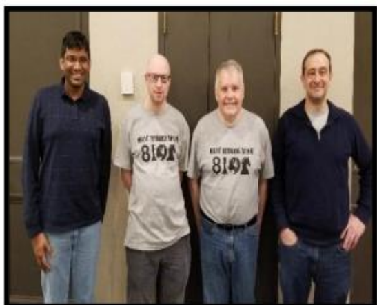
BITCOIN PONZIANI SCHEME