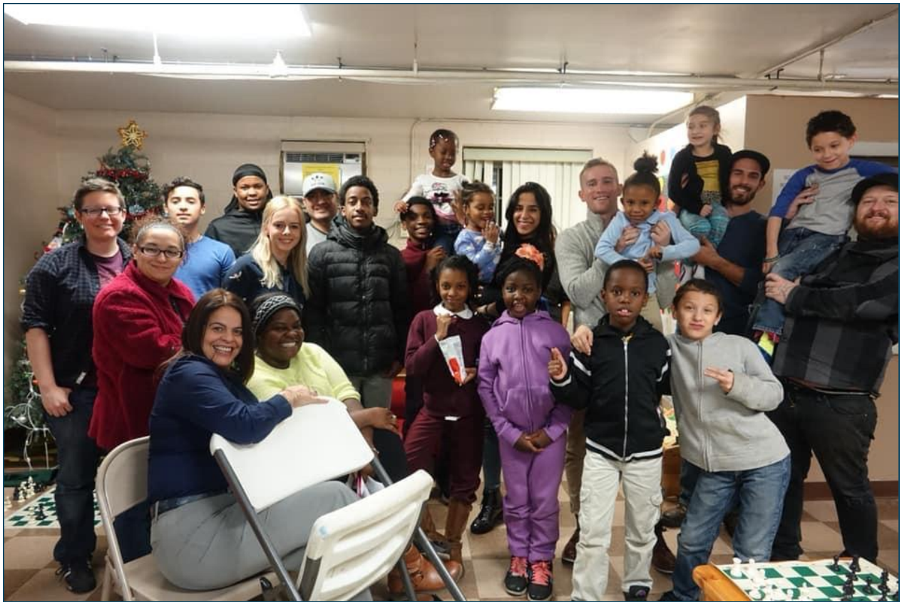
The DIG Family Photo at the Downtown Bridgeport Public Library

As you can tell, the stories can go on and on. The moral of the story is that chess is connecting people who have resources and experience to young people who really could use some help. It gives them a common ground even though their cultures and upbringing are completely different.”