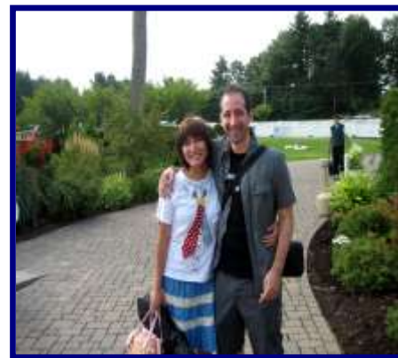
The Shemeshs 2010 New Britain Summer Open