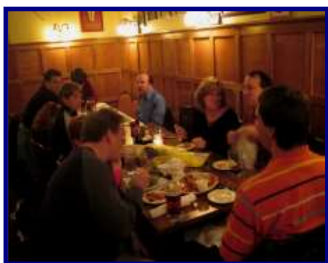
The NBCC in party mode once again