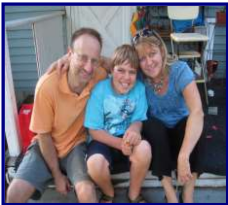
The Kubiaks 2010 Zimmerman Games Day