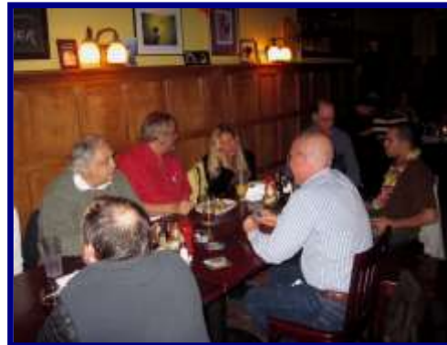
Celebrate good times – come on!