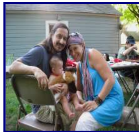
The Montiells 2010 Zimmerman Games Day