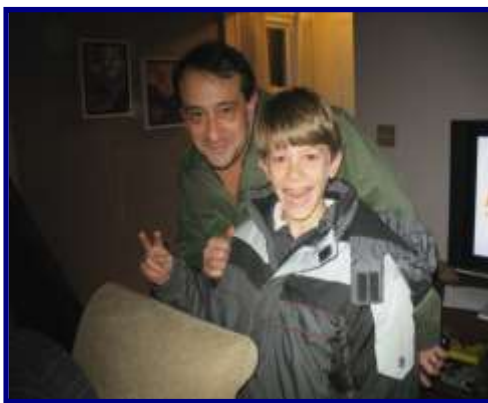
The Pascettas Party at the home of the Montiells