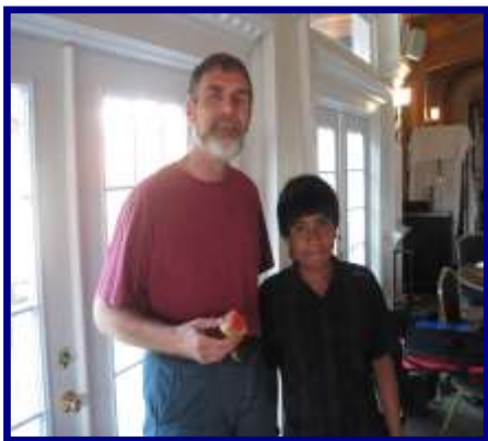
The Connors 2010 New Britain Summer Open