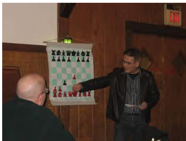
Lecture by GM Ildar Ibragimov