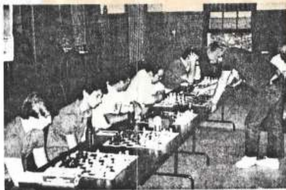
ROB ROY photo

Players will be grouped into sections of four players each to play three rounds at the time control of a game each 30 minutes. The entire "quadrangular" will occur from 8 and 11 p.m.