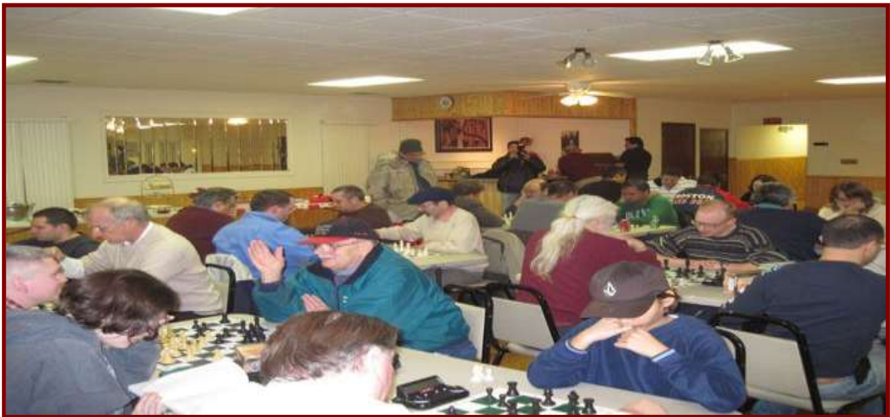
FRIENDS FROM THE CT CHESS COMMUNITY HAVING FUN AT THE 2010 NBCC CHRISTMAS PARTY