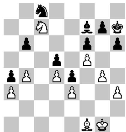
Position after 41. Nxc7

{I have never seen a knight moved to this square with such devastating effect! Black's queenside now crumbles.}