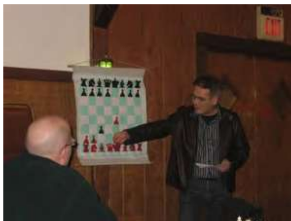
Lecture by GM Ildar Ibragimov